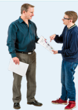
Your Support Worker