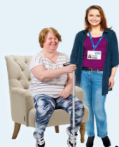
Your community nurse