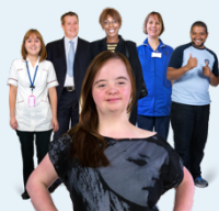
Your hospital team