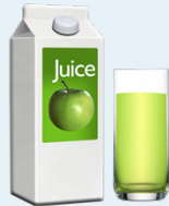
Fruit juice WITHOUT BITS